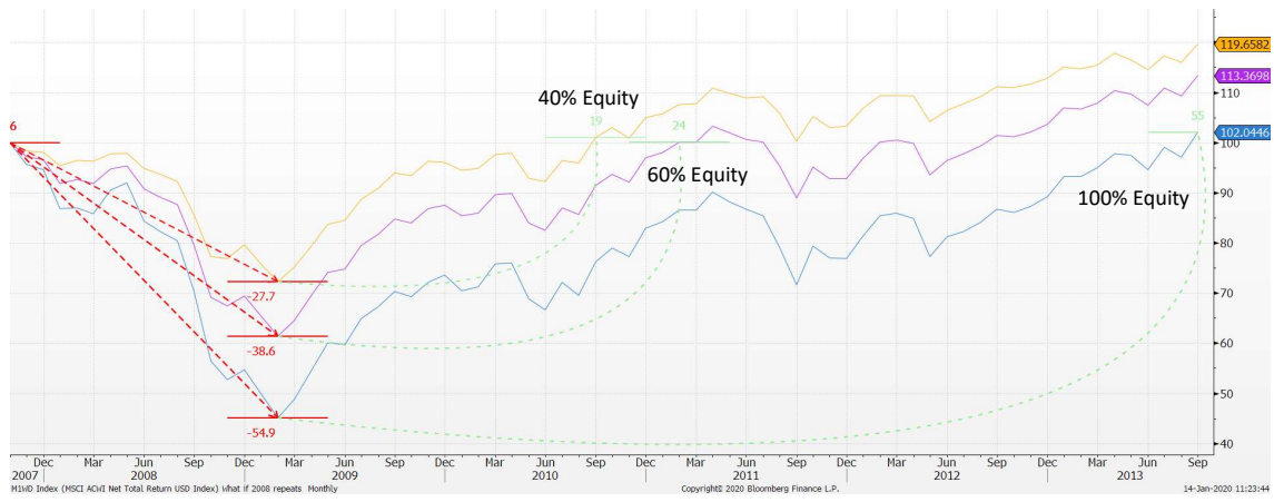
Figure 1 Drawdown and recovery period for three types of portfolios during 2008 financial crisis

Investors have two major pain points to deal with: The maximum loss they can take, and the time it takes to recover these losses. The appetite to stomach these two pain points determines each investor's risk profile. Figure 1 shows the total peak to trough losses, and number of months it takes to recover for three types of portfolios during the 2008 financial crisis.